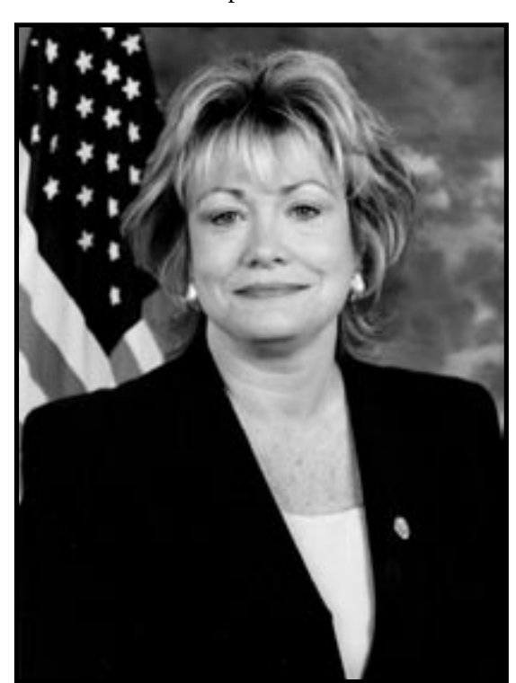
Rep. Ellen Tauscher (D-CA) - official press photo

Although the 2005 version of this bill (109th Congress H.R.1059) died in committee at the end of the session with just 122 co-sponsors, H.R.1246 headed out of the gate with 110 co-sponsors on board, including several freshman Representatives.