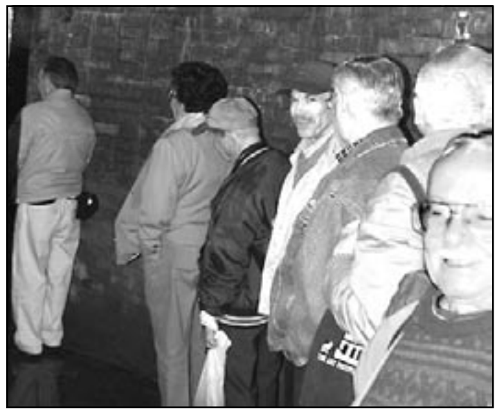
Delegates wind their way through the tunnels below the Cuyahoga County Soldiers & Sailors monument. This area is normally off-limits to the public as they are working on renovations, but the monument is staffed by veterans, and so we were able to get a special tour