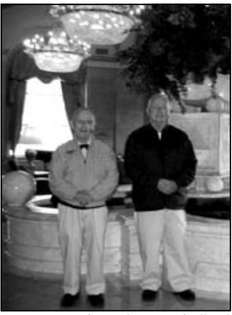
lins visit the the Renaissance Hotel at the historic Terminal Tower

Marie Ann Bohusch AVER 2007 National Convention