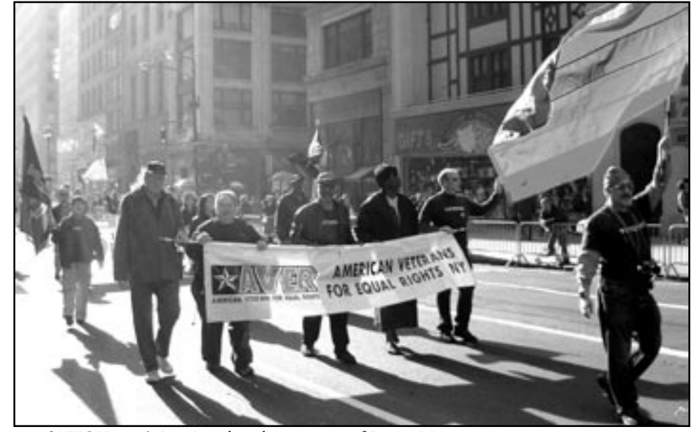
2006 NYC Veteran's Day Parade