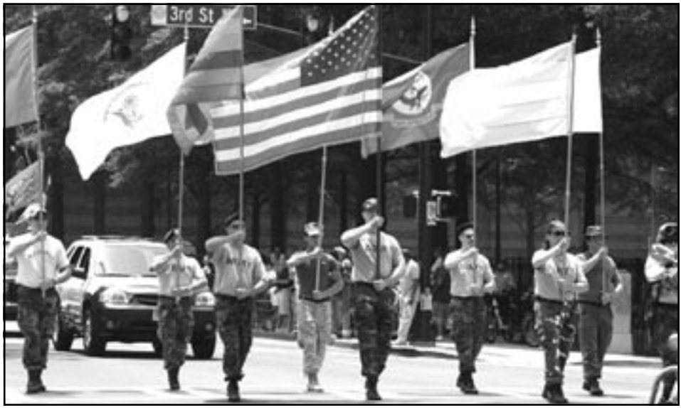
AVER Georgia leads the Atlanta Pride Parade