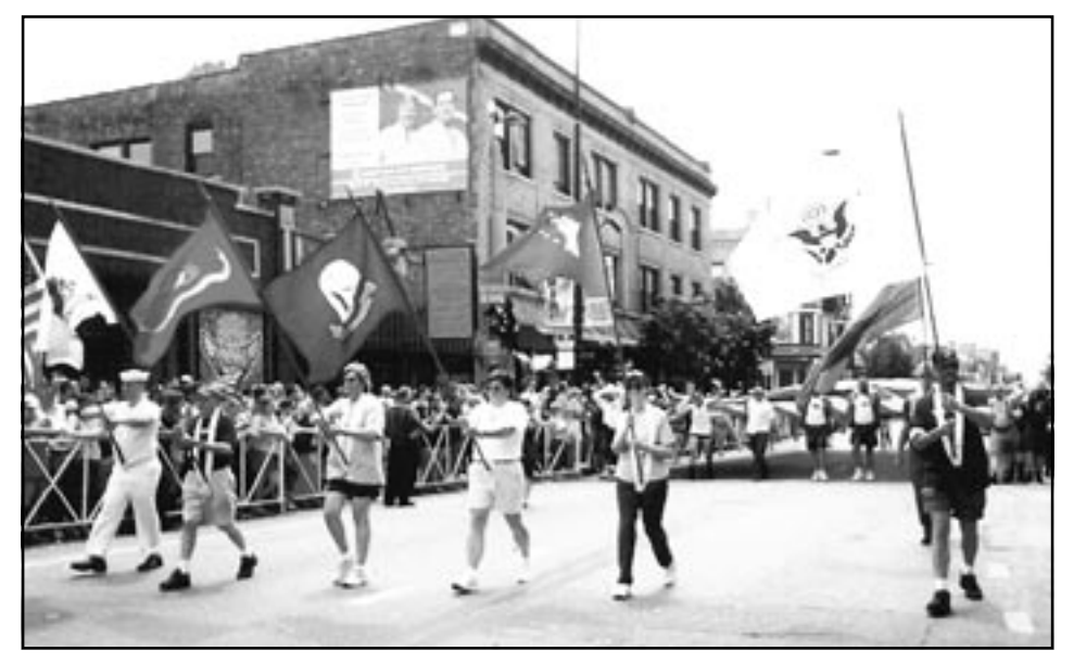
The Chicago Chapter of AVER makes its way down the route of Chicago's 38th Annual Pride Parade with GUS - a 30-by-50 foot United States flag

Missing a photo? HOLY COW! Where did it go!?!