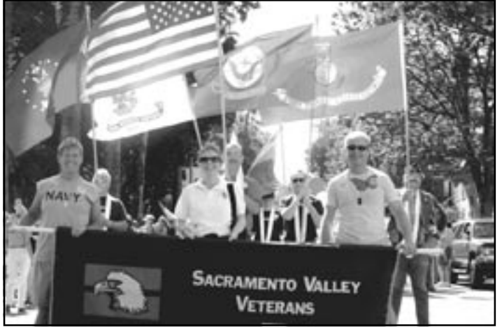
Sacramento Valley Veterans lined up before the Sacramento Pride Parade, awaiting their motorcycle escort for the official step off - photo courtesy of Ray Allen