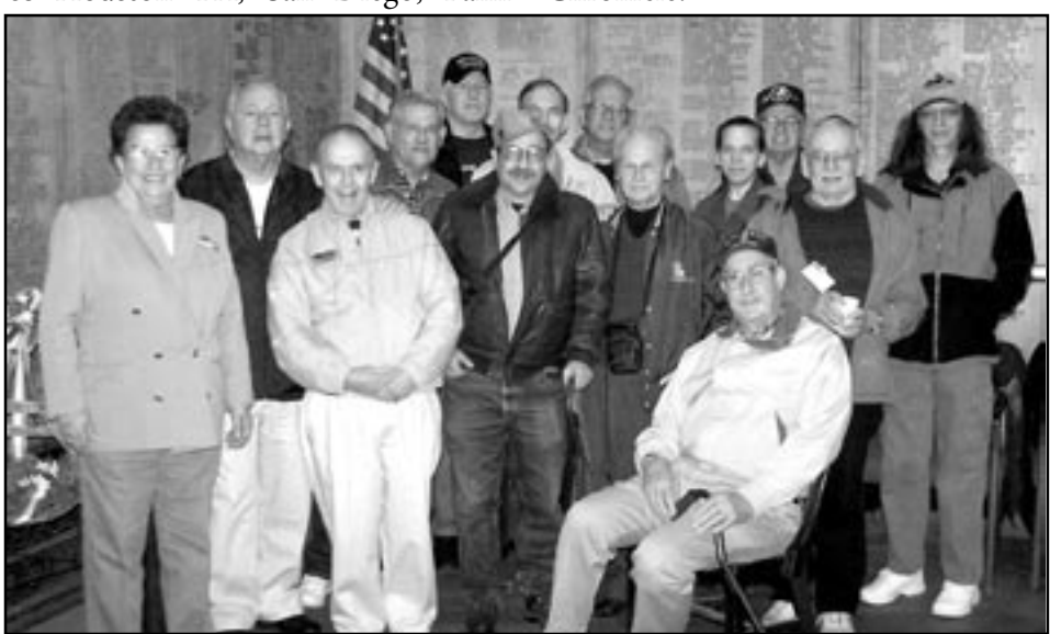
inside Cuyahoga Cty. Soldiers & Sailors Monument

The convention's sumptuous open festival of food and drink had invited guests from the Ohio LGBT community including representatives from Equality OH, Cleveland Pride, Transgender American Veterans Association (TAVA), and the Gay People's Chronicle.