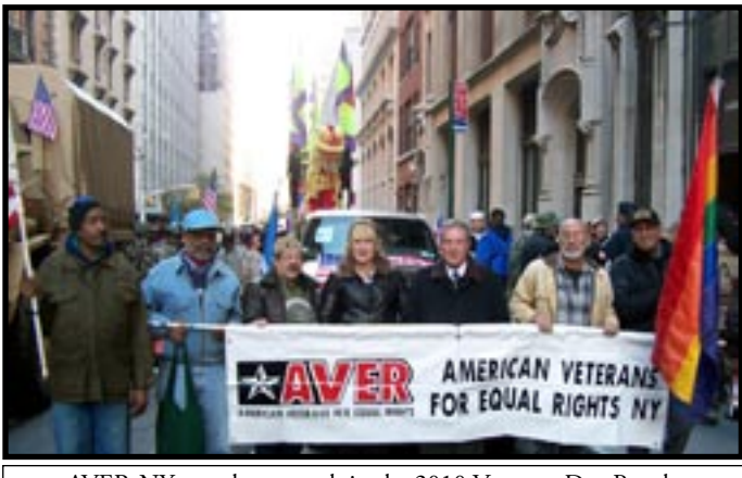
AVER-NY members march in the 2010 Veterans Day Parade

Save the date - 6-9 October 2011 - AVER National Convention - Albuquerque, NM