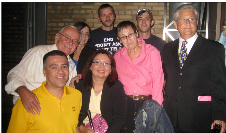
Chicago veterans hail the end of DADT with ILNG LTC Tammy Duckworth, 20 September 2011