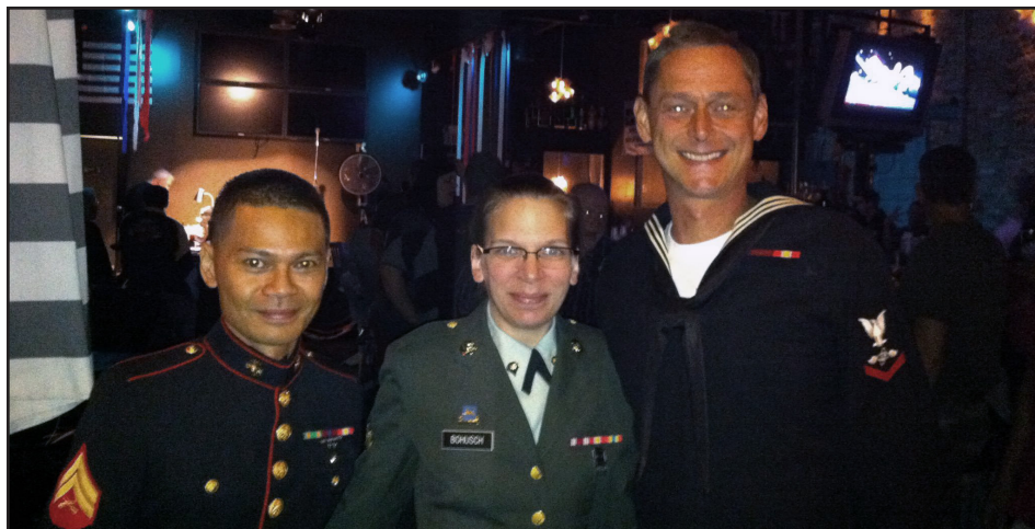
Cleveland veterans celebrate at NEOAVER's DADT Going Away Party, 19 September 2011

President -Ty Redhouse 916 436 7676 facebook.com/groups/sacvalleyvets sacvalleyvets.com