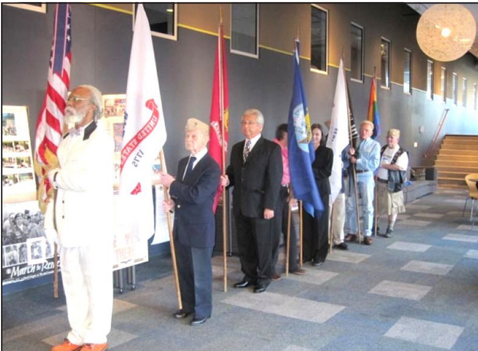
Chicago Gay Veterans color guard

In the Veterans Day Parade this year the LGBT veterans were joined by several active duty members of OutServe. It was the first Veterans Day following the repeal of DADT and thus the first opportunity for openly gay active duty service members to join a Veterans Day Parade. The combined active duty and veterans and Color Guard marched proudly behind AVER and OutServe banners. This will be the third year that AVER has marched in the parade and again was well received. Members of both organizations were interviewed by ABC and spoke of their pride in being able to march in the parade.