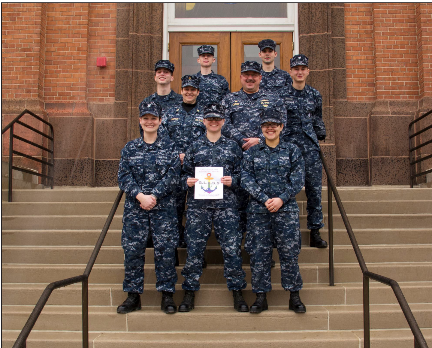
GLASS founders.