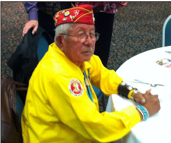
Former Navajo Nation Chairman & USMC Navajo Code Talker WWII Veteran Peter MacDonald, distinguished guest, Albuquerque, October 2011