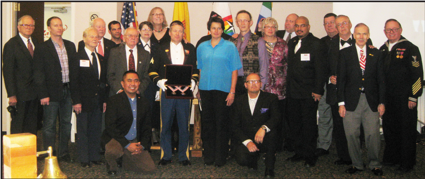
October 2011 - Several members of AVER gather at the AVER 2011 National Convention in Albuquerque, NM

THE NATIONAL NEWSLETTER OF AMERICAN VETERANS FOR EQUAL RIGHTS, INC. VOLUME 6 ISSUE 1 APRIL 2012