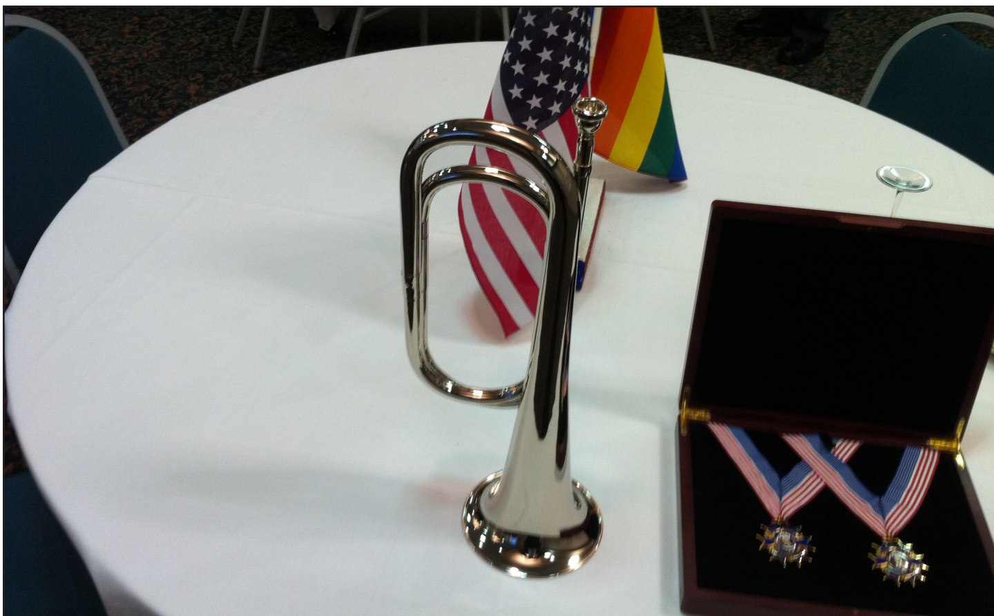
October 2011 - Empty Table Ceremony at the AVER National Convention in Albuquerque for members who died since the 2009 Convention.