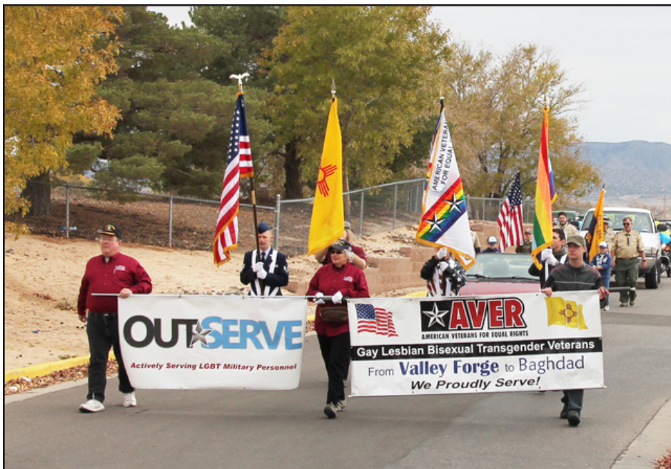
11 November 2011 - AVER Bataan color guard with several OutServe members