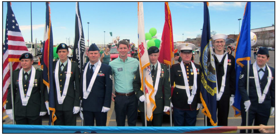
17 March 2012 - AVER-RMC Color Guard in Denver St. Patrick's Day Parade