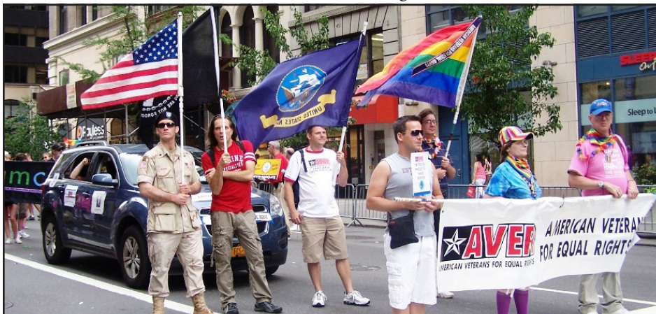
AVERNY in the 2011 NYC Pride Parade