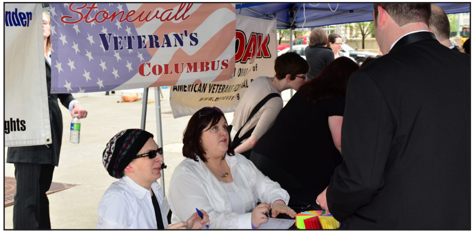
24 March 2012 - Cleveland Rally for Marriage & Full Equality

We thank AVER National for endorsing this important event.