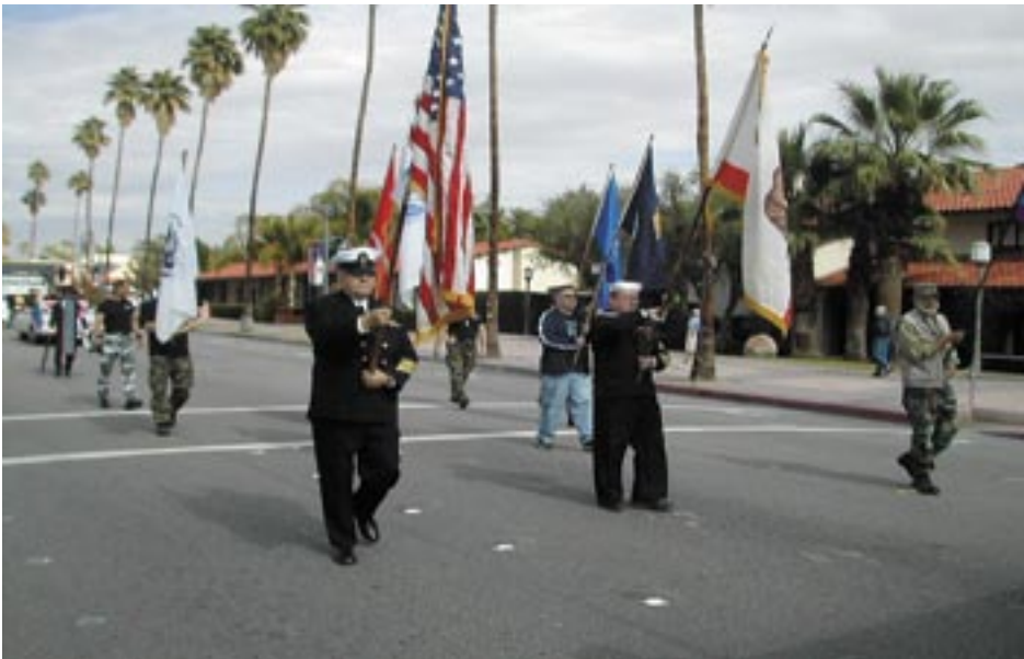
(left) Uniformed members of the Palm Springs Chapter proudly displaying their colors during the city's annual Pride Parade this past Fall.