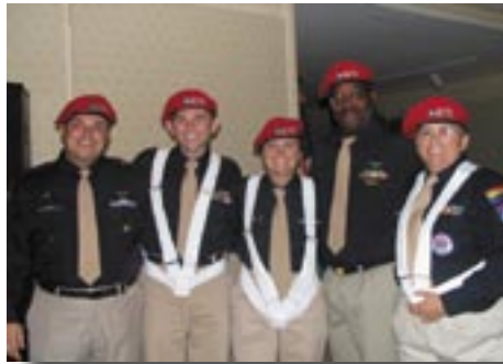
AVER Chapters currently on Holiday Hiatus

AVER isn't about forcing anyone to do anything. However, the advantage of having the same uniform in every chapter across the country is that we can achieve a uniform look for the AVER National Convention, or other events where it might eventually be possible to organize large-scale color guards or details. Such as the annual wreath laying at Arlington National Cemetery each Memorial Day. We believe we have devised a uniform, based on extensive input from AVER members across the country, that is practical, sharp-looking, and will greatly improve GLBT veteran visibility, and we sincerely hope you will wear it proudly.