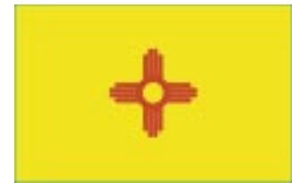
Albuquerque Bataan Chapter