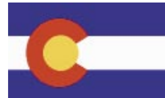
Rocky Mountain Chapter